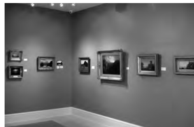
Installation in the Catharine Beecher Gallery