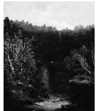
Thomas Cole, Kaaterskill Falls , 1826. oil on canvas. Graham Williford Foundation for American Art, Fairfield, TX

The 2008 exhibition at Cedar Grove addressed the subject of Thomas Cole's "oil sketches", a relatively unknown aspect of Cole's artistic output and process. The show included twenty-one artworks by Cole, and eleven paintings by several of his followers, including Frederic Church, Albert Bierstadt, and Sanford Gifford. Also on display were evocative instruments of Cole's craft including his paint brushes, traveling sketch box, and palettes still covered with paint.