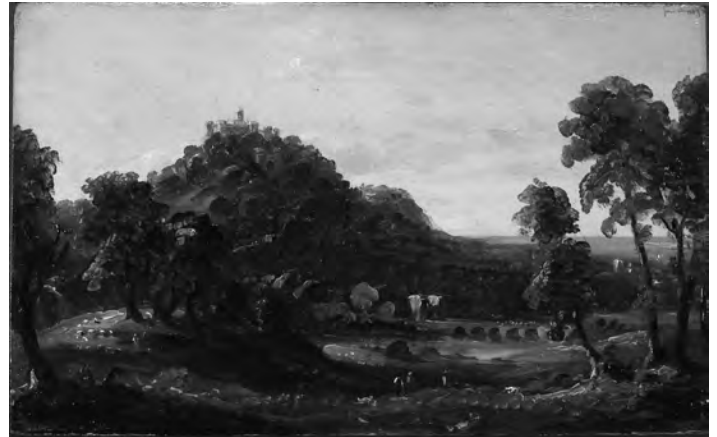
Thomas Cole, Sketch for Departure , 1837. oil on panel. Private collection

The 2008 exhibition at Cedar Grove addressed the subject of Thomas Cole's "oil sketches", a relatively unknown aspect of Cole's artistic output and process. The show included twenty-one artworks by Cole, and eleven paintings by several of his followers, including Frederic Church, Albert Bierstadt, and Sanford Gifford. Also on display were evocative instruments of Cole's craft including his paint brushes, traveling sketch box, and palettes still covered with paint.