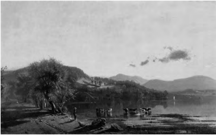
Arthur Parton, Mount Merino , 1865. oil on canvas, 12 x 20 in. Private collection

The Hudson River held and continues to hold deep symbolism as America's first river, encompassing both America's first vacation route and first industrial route. The inclusion of the Hudson River in a 19th-century painting was therefore often resonant with meaning. Next year's exhibition of 19th-century views of the Hudson River will explore the artists' choices regarding depictions of the river and its related bodies of water, especially in the region of Catskill.